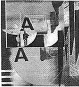
HARRIET FeBLAND, "Night Walk," monotype